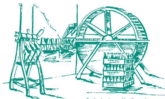
Bottle cleaning and bottling as it was common in the past.

Should you have any questions with regard to allergens and ingredients, please contact our service staff.